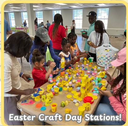
Easter Craft Day Stations!