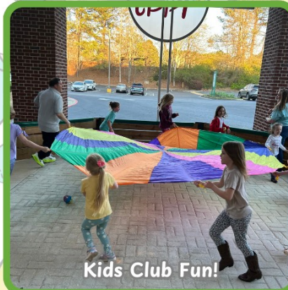
Kids Club Fun!