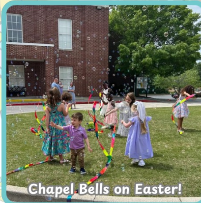
Chapel Bells on Easter!

Treehouse Clubs will meet May 7th and 14th then break for the summer!